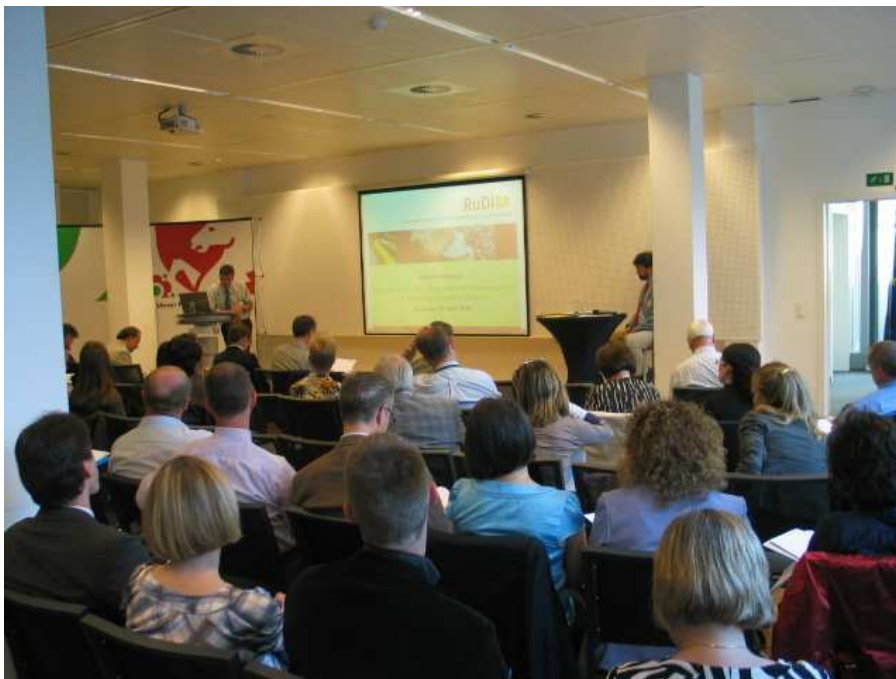
Figure 5: Presentation at the RuDI Final Conference in Brussels, June 2010