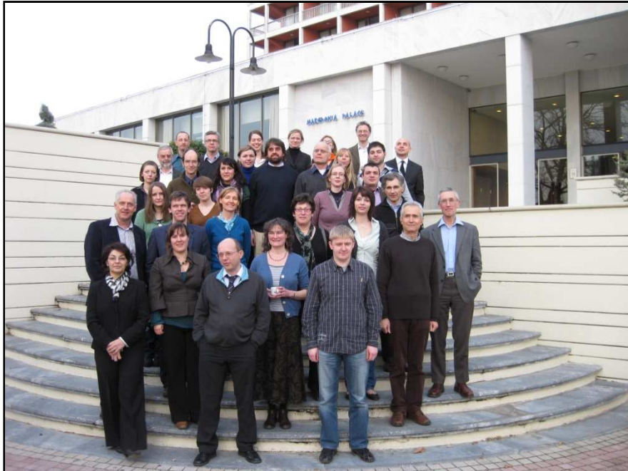
Figure 4: RuDI researchers and members of the International Expert Group at a project meeting in Thessaloniki, February 2010