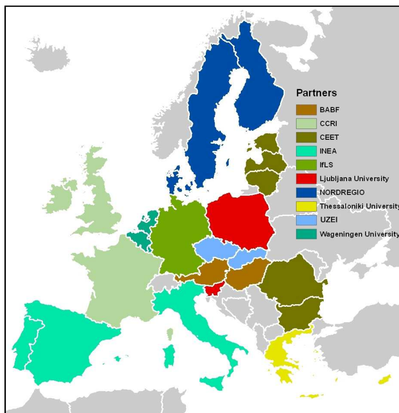
Figure 1: Coverage of Member States by RuDI consortium members