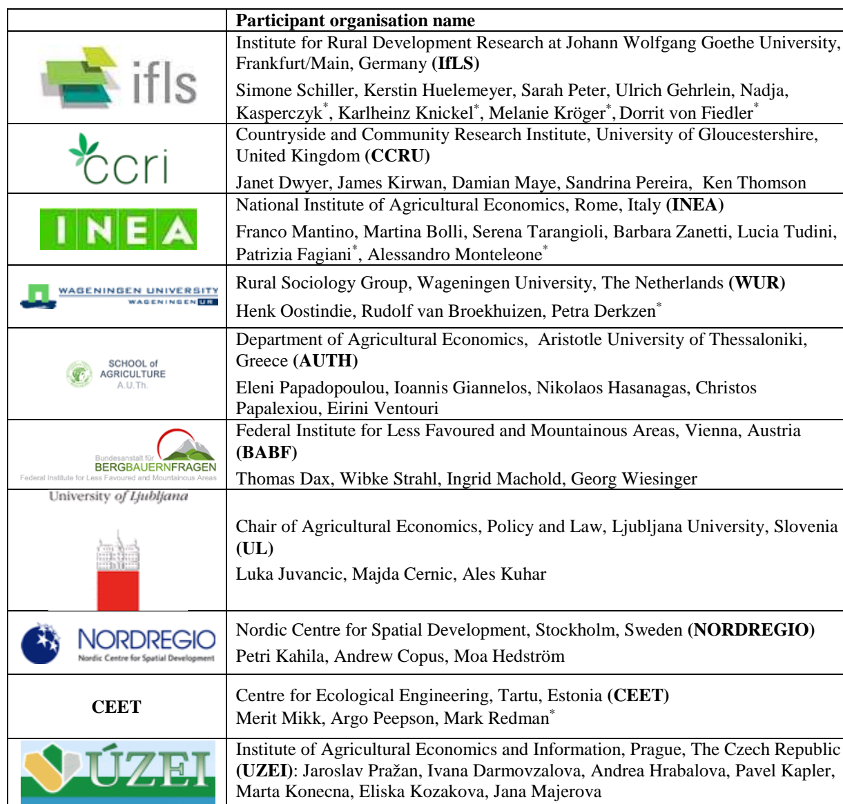
Table 1: Coordinated by the Institute for Rural Development Research (IfLS), the RuDI consortium comprises 10 research institutes that reflect the variety of European member states.