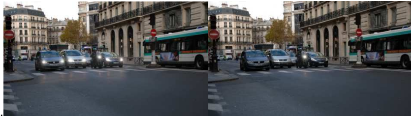
Figure 3: Studies on effects of background conditions & traffic situations