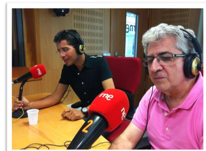
4: Project Coordinator and Co-Coordinator – at “Doble Hélice” Radio Program