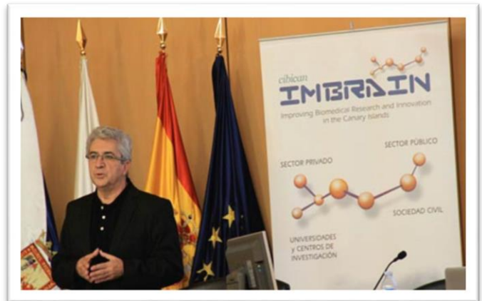
2: Project Coordinator during project presentation