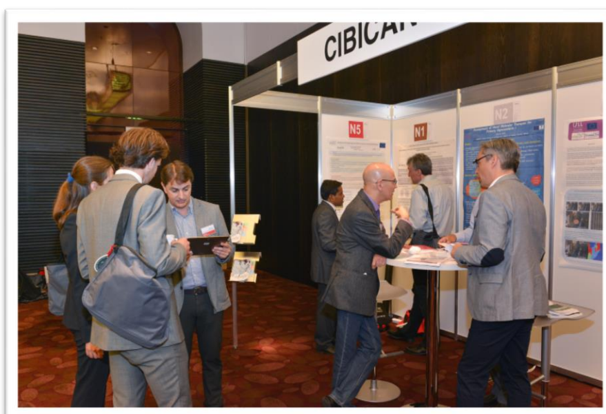
11: At Biovia 2015 promoting the CIBICAN technologies led by the Innovation Manager hired by the IMBRAIN Project