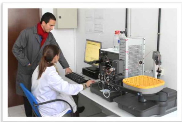
9: IMBRAIN researcher with the Microcalorimetry funded by the IMBRAIN Project