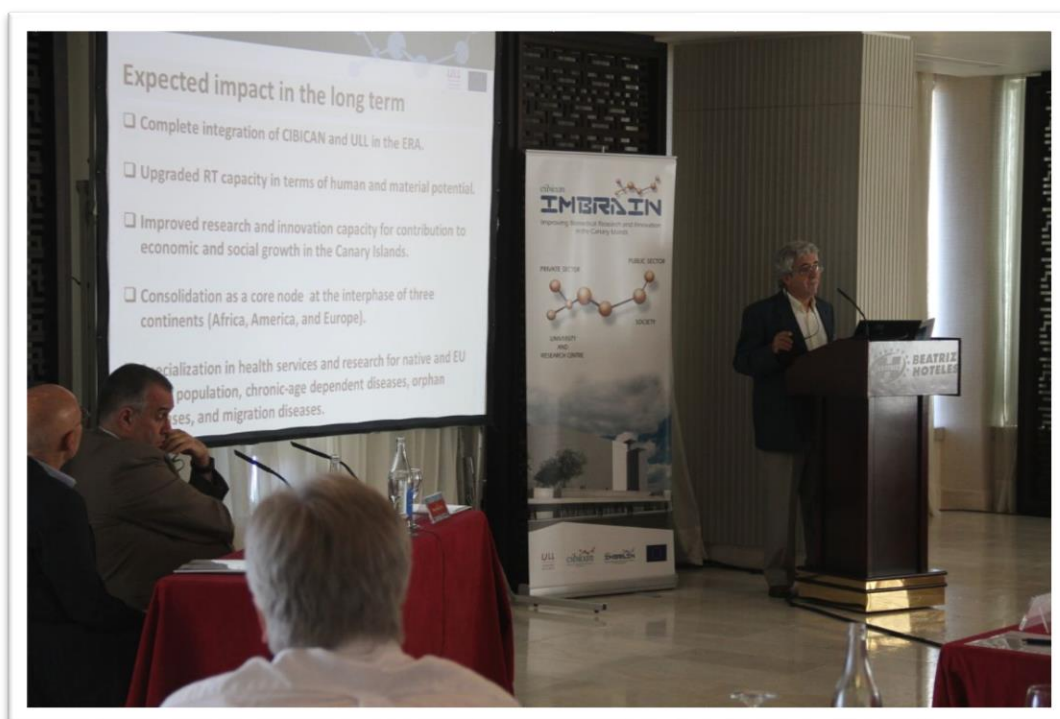
7: During the Conference on Molecular Pharmacology and mechanisms of new anticancer drug in front of around 90 specialists in the field