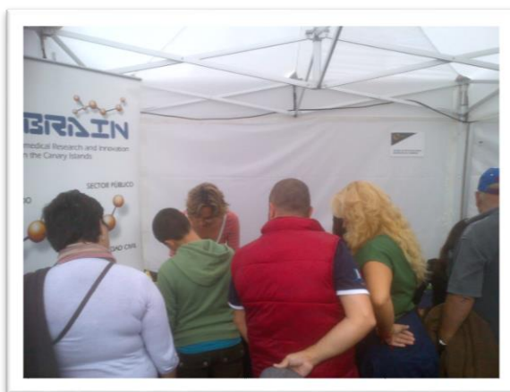
5: In the X Orotava Science Festival