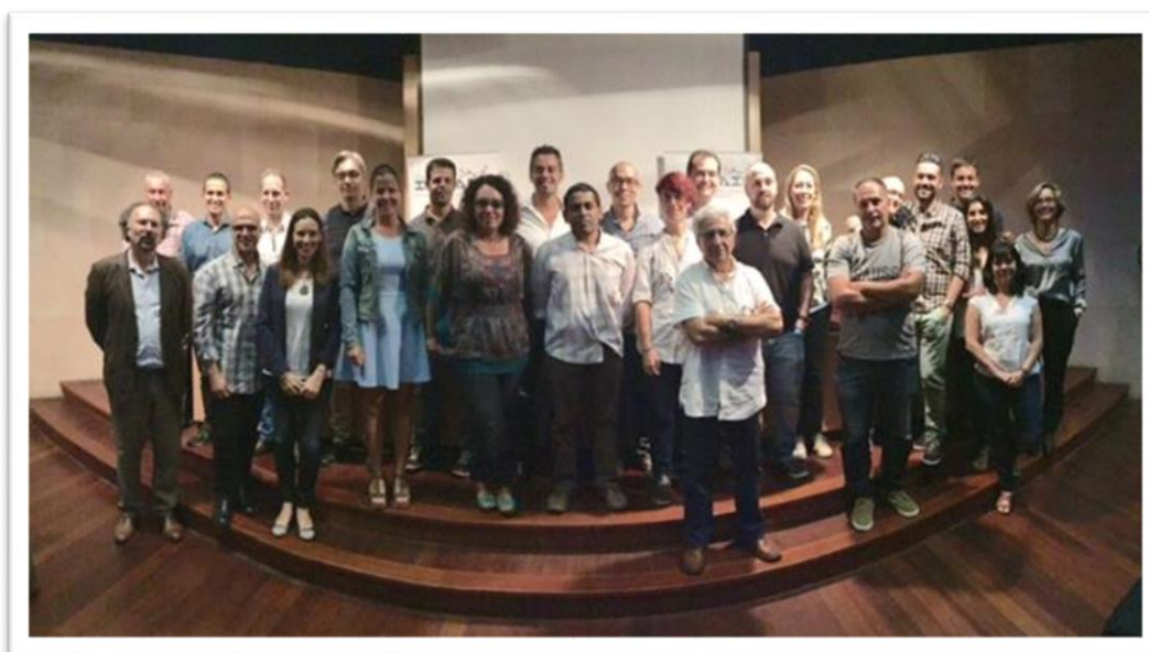
12: IMBRAIN researchers after the presentation of the Project Execution Results