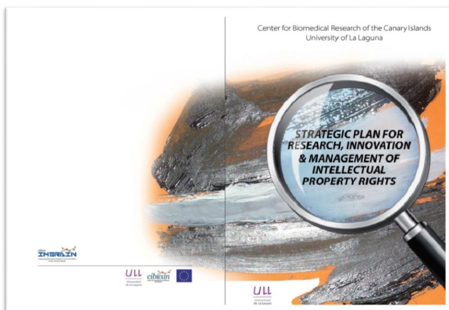
13: Strategic Plan for research, innovation & Management of Intellectual Property Rights