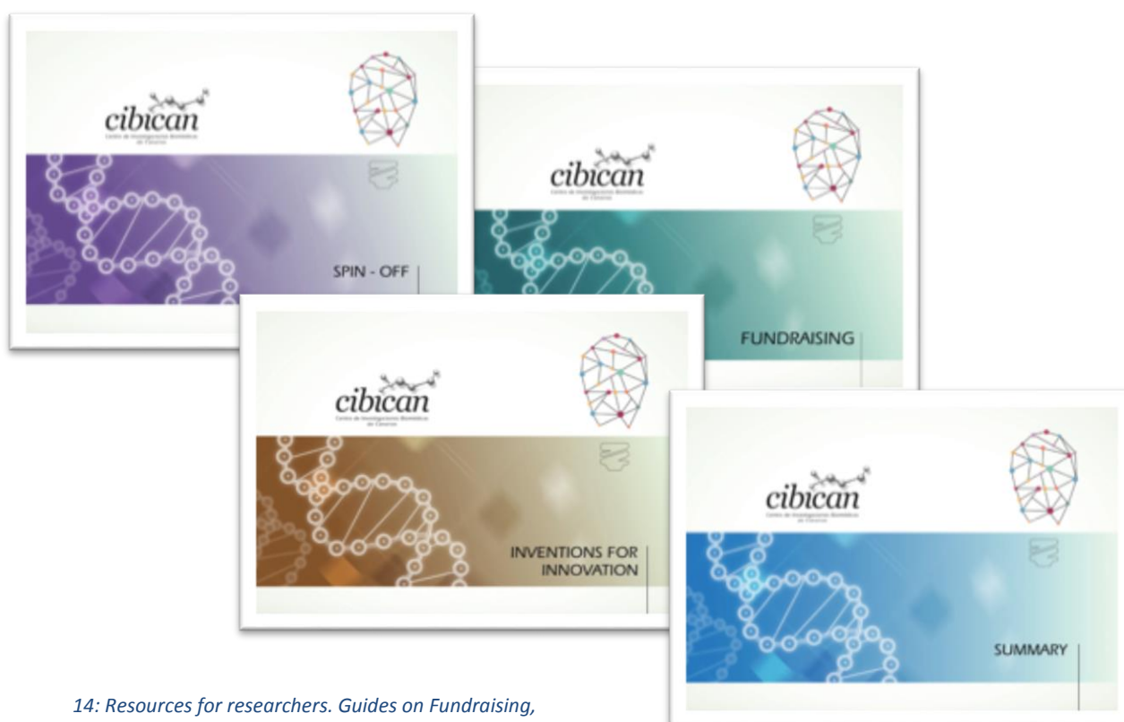
14: Resources for researchers. Guides on Fundraising, spin-off, inventions for Innovations, and a handbook