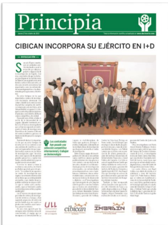
3: Press media announcing the hired researchers by the IMBRAIN project