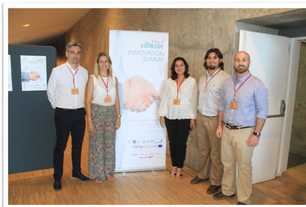
8: IMBRAIN staff responsables of the project, communication and technology transfer management execution at the CIBICAN Innovation Summit