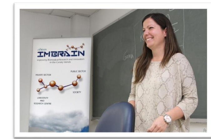
6: IMBRAIN researcher during the Introductory Course in Health Economic Evaluation