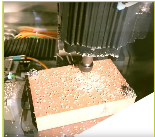
A snapshot from the CassaMobile video showing the CNC mill module at work.

Five modules were successfully integrated. The Additive Manufacturing (AM) module is capable of producing high quality parts with a range of engineering thermoplastics. The module includes high temperature material extrusion, variable nozzles, a heated platform and a heated build chamber. This enables the highest possible quality and flexibility. Uniquely the AM module also incorporates in-process inspection. A vision-based system compares any given layer built by the machine to the original computer-aided design data. Any discrepancy between the layer built and the reference data can be calculated and if beyond user specified tolerances will trigger an alert. The build process can then be aborted or remedial action taken in subsequent process modules. The in-process inspection saves time, reduces waste and ensures high quality parts.