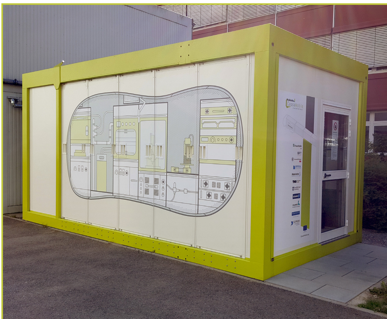
The final and working container at the Fraunhofer campus in Stuttgart.

In total 20 potential exploitable results were identified and documented during the project. Use cases' related exploitation outcomes were evaluated closely and a road map until 2020 was created guiding the next activities to maximise the commercialisation impact.