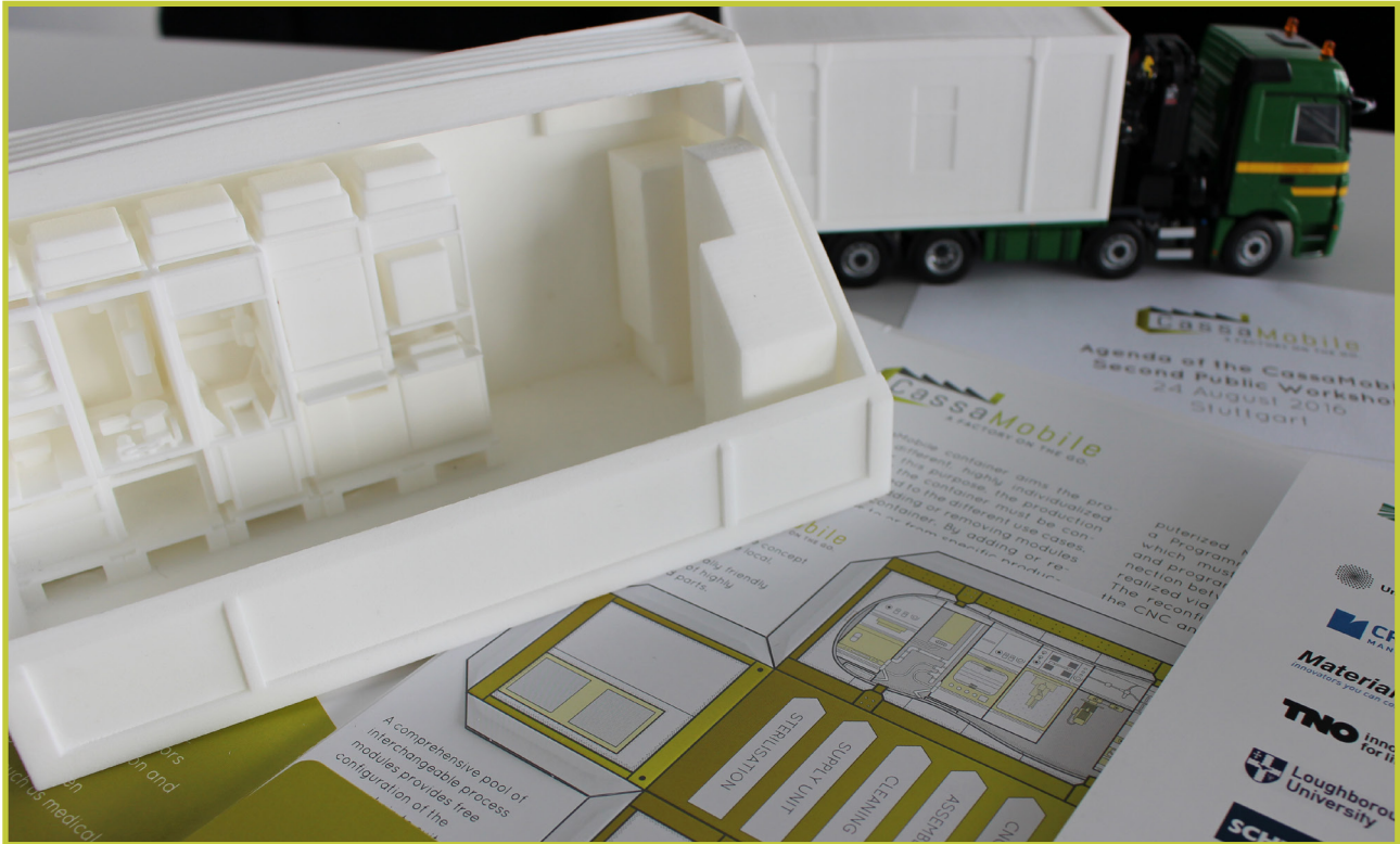
A 3D plastic model of the CassaMobile container.

parts with reduced costs, lightweight-constructions and shorter delivery times. Combined, they can result in meeting customers needs in time with a lower cost to differentiate the manufacturer from competitors.