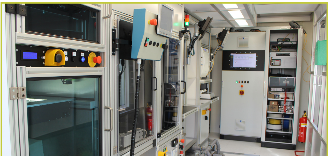
The container inside with all working modules installed.

Schunk performed further development on the planned use-case featuring three different concepts for individual grippers. The CassaMobile generic demonstrator component was also manufactured to assess the various processing and handling steps required for the production of the gripper concepts. Additional activities were performed to further optimise the identified gripper concepts for realisation within the CassaMobile process flow.