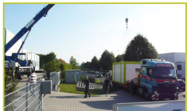
The CassaMobile container is being unloaded at the Fraunhofer campus in Stuttgart.

The CassaMobile concept aimed to provide a local, flexible and environmentally friendly production of highly customised parts. The production system is based on a truly modular architecture, allowing an instant adaptation to rapidly changing requirements. This ‘plug