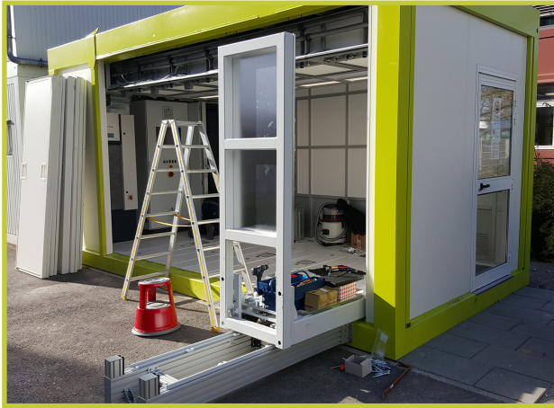
The container side wall is removed allowing the first tests modules to be installed.