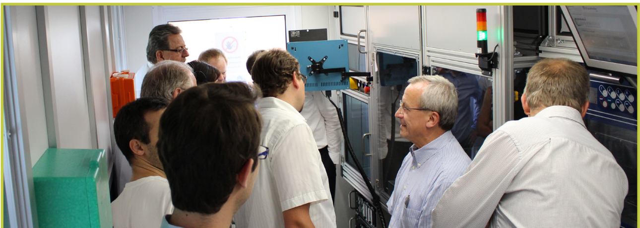
The CassaMobile live demonstration of the container and all working modules, highlight of the final workshop.

Industrial impact of the CassaMobile system was illustrated by the aid of three use cases during the project. Highly demanding products, bone drill guides and orthoses from medical sector and industrial grippers from the automation industry were chosen. During the project, the system's ability to meet these demanding product requirements was demonstrated. The exploitation outcome, impact and unique selling point (USP) of CassaMobile within the selected industries as well as others were identified.