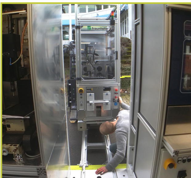
The final assembly module is being installed in the container.

and the 'System concept' was developed. The comprehensive overall system concept was implemented in all R&D work packages (WP2, 3, 4, 5). The project was scientifically coordinated and supervised out of work package 1 to ensure successful cooperation of all participants. Relevant standardisation, regulation and pre-normative research aspects were considered throughout the industrial requirements and the system concept.