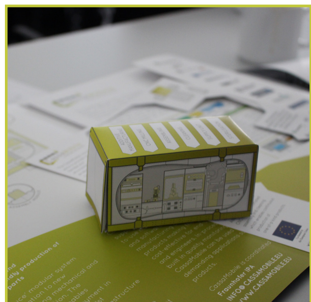
The Container paper model.

In the case of industrial grippers, novel materials and adapted designs of gripper jaws make it possible to use additive manufacturing, leading to reduced production costs. This enables manufacturers to bring the technology to industrial applications like automation components with the focus on handling tools. This can lead to individualized (customer-specific)